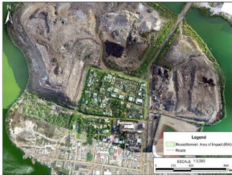
1.4. Resettlement Area of Impact Demographics of the

Surface water sampling of the Great Salt Pond contained detectable concentrations of aluminum, copper and iron, along with Total Dissolved Solids (TDS) and chlorides. The surface water samples also revealed high levels of total coliform bacteria and E. coli at levels too numerous/elevated for the laboratory to quantify. This suggests that sewage is being discharged into the Great Salt Pond. Based upon the testing results, baseline conditions within the Great Salt Pond suggest that the water quality may have a negative impact on flora and fauna within the pond and poses a potential health risk for human recreational and/or consumptive use.