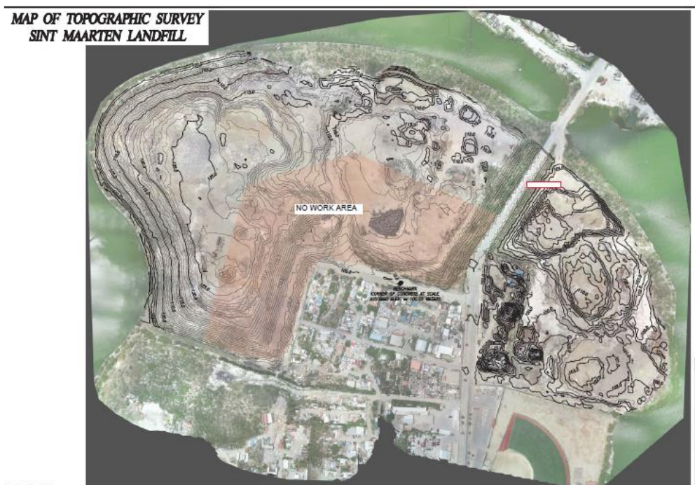
Figure 5.1 No Work Zone, as recommended by SCS Engineers April 22, 2020