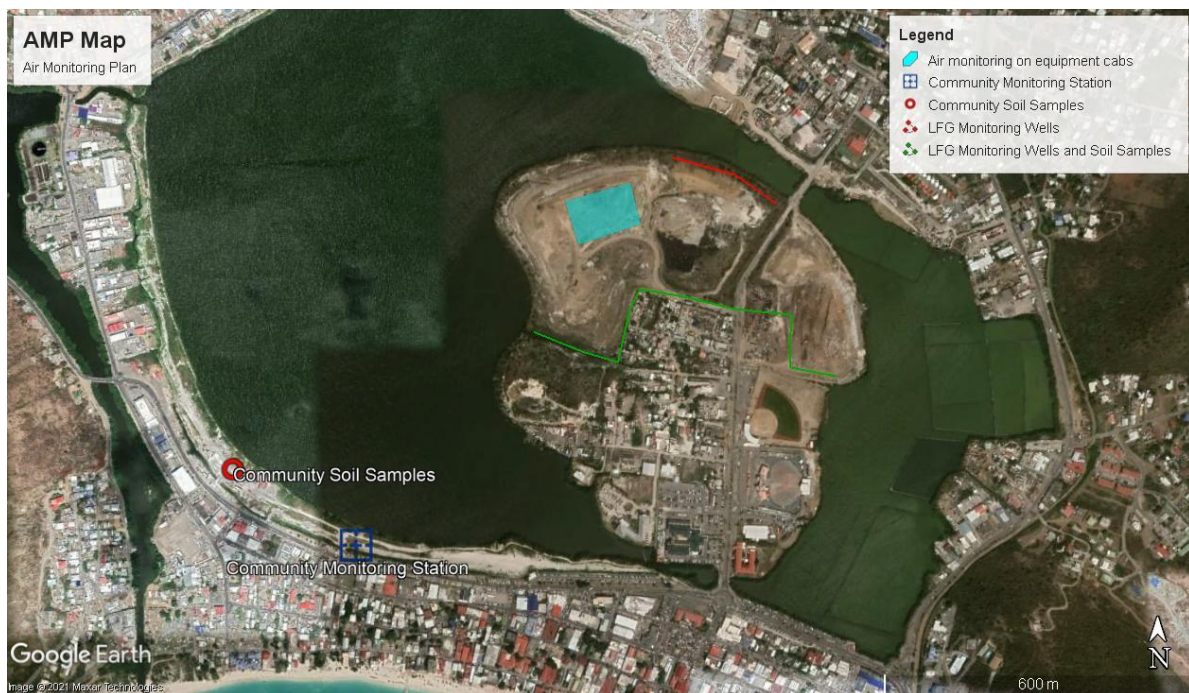
Table below summarizes the air monitoring plan.

Analytical dust sampling from selected community locations will be also included for the purpose of accessing public health exposure from various pollutants, directly or indirectly related to fire and other landfill air emissions. Soil analysis parameters shall be the same as mentioned above. Three (3) analytical samples will be tested per year. Samples shall be send to an accredited laboratory for analysis.