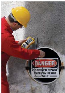
Confined space testing with the MultiRAE Lite