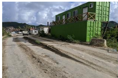
Figure 2.1 shows the existing security and scale house and old weighbridge scale location and future location of new weighbridge scale and the trace of the access road that will be reconstructed.

The road design shall ensure safe entry of trucks to the weighbridge scale and exit and return point for large trucks. The nominal capacity of the weighbridge scale must be 45 metric tons. Works will include the installation of the electrical infrastructure suitable for the connection of the scale to power source and for reconditioning the existing metal container facilities as the scale operating office.