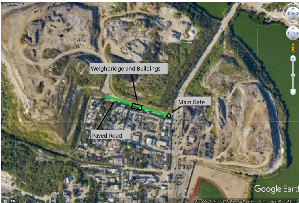
Figure 2.2 show details of the location of works related to the paving of the existing access road (Brine Drive) to the MSW landfill, the placement of a main gate, weighbridge scale and buildings