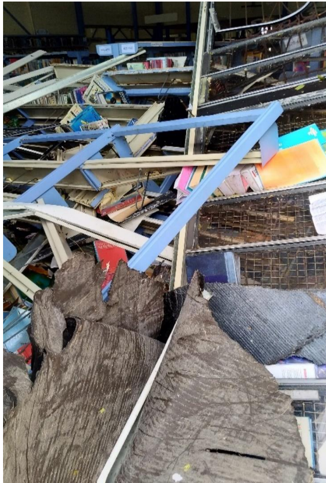
Figure 2: Destruction at StML caused by Hurricane Irma in 2017

The services which were offered by the StML are now only available at a very limited level due to the destruction from the hurricane and temporary limited housing. The main building of the StML was severely damaged by Hurricane Irma in 2017. Looters compounded the problem by breaking into the key box and opening the locked media lab and making off with all the computers. Both the front and back offices of the library were wrecked by the hurricane. The public area in the old building was partially destroyed.