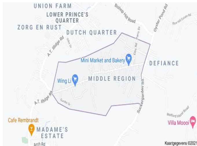
Figure 1: Middle Region (Location of SML Primary School)

Middle Region is to a large extent a residential area. It is an authentic residential district, with many other functions between the homes: shops, schools, day-care and business activity. These businesses and facilities have a (mostly) local function.